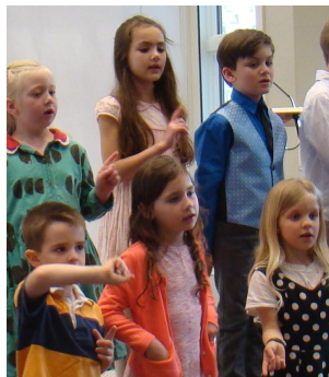
Prelude Music during their Sharing Time

Singers presented an end-of-semester sharing time for parents in the fall and spring as well as sang one song with the performing choirs at the spring concert at St. Peter's Lutheran Church. Prelude Music and Choristers are non-auditioned classes.