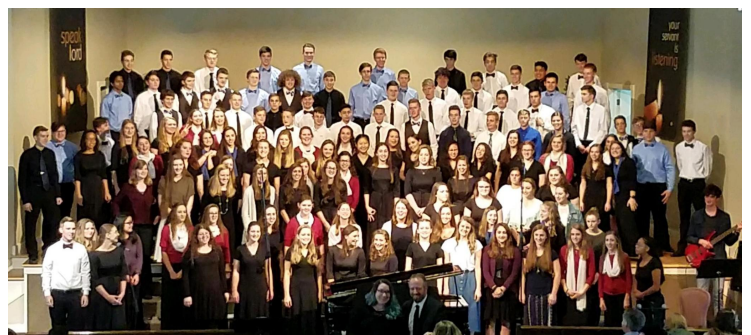
Chamber Choir with mass choir at Choral Fest

Choral Fest is held every other year and is hosted by Rosedale Bible College. The mass choir this year consisted of approximately 130 singers from six states.