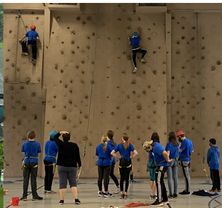
Top left: Chamber Choir singers at Camp Hebron Bottom left: MCCL performing at Lititz Springs Park Top right: Concert Choir singers at Camp Hebron