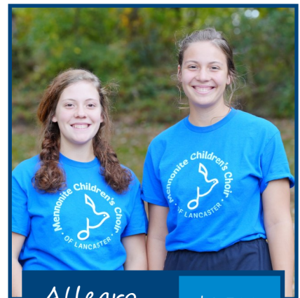
Allegro running with us $1,500+

4 weeks of singer growth and community impact for 8 young singers*