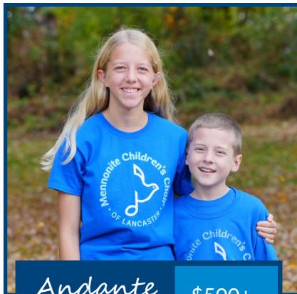
Andante walking with us $500+

"I have gained more confidence and I love learning songs in different languages."